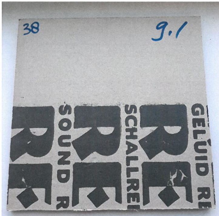
Figure 1. Picture of the received sample